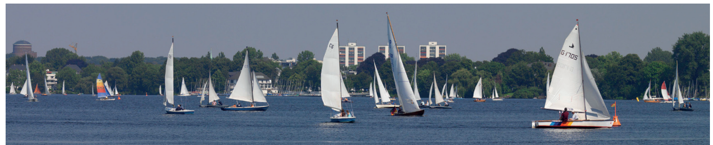
City of Hamburg: Sailing at the Outer Alster